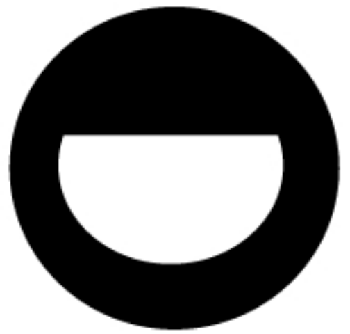
Mouth Outline - Cut 1