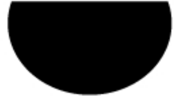
Mouth Large - Cut 1